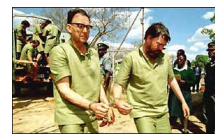
White farmers in Zimbabwe now oppressed by President Mugabe.